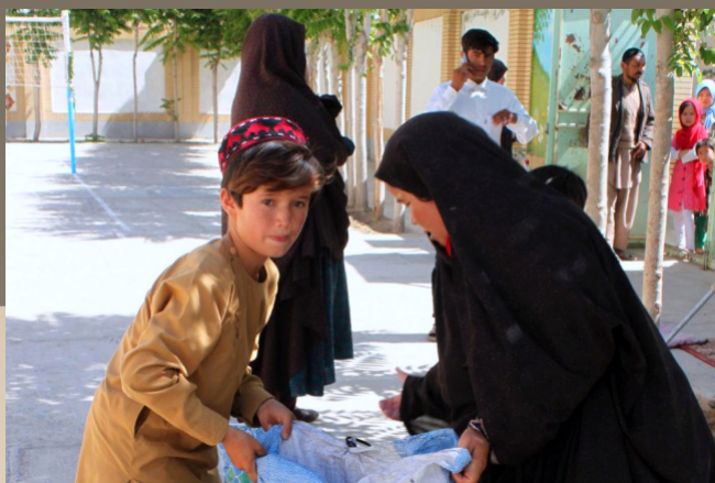
Education for widows ...

Hundreds of deaf people Uzbekistan can also enjoy food, winter clothing and firewood.