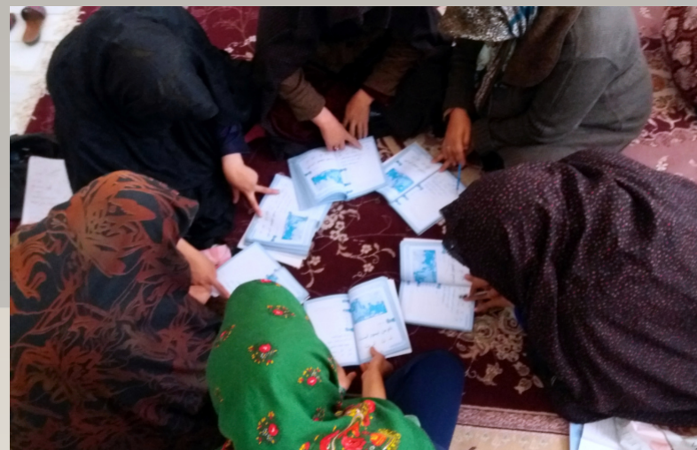
...in Sharak-e Mustafa/ Herat province