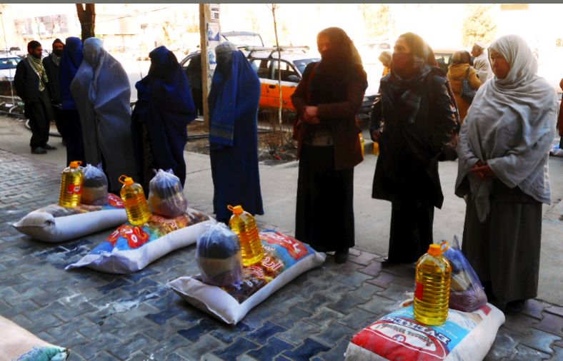
Food distribution in Chalou Camp

traditionally marginalized in Afghan society, often living in camps and making a living by begging; the men offer themselves as day laborers, but hardly find employment in these corona times. We have been working with the people in the "Chaman Babrak" camp in Kabul for years, have set up a drinking water supply there with a deep well, give them food, firewood, and sometimes winter clothing every winter. When in the extremely cold January 2020 25 women and 50 children had already frozen to death, we started a call for help, because we lacked the money. As a result, we received generous donations and were able to prevent the very worst by distributing food and firewood. In the meantime, people have been trained in the necessary corona hygiene measures, and we were