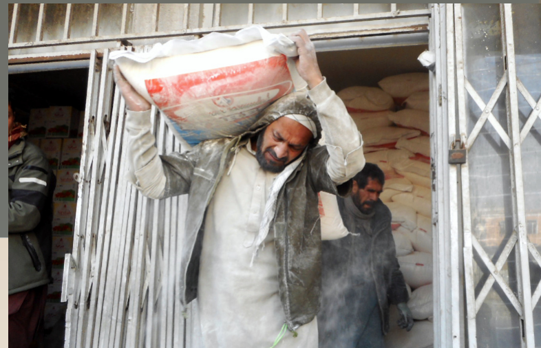
Procurement of food at the bazaar