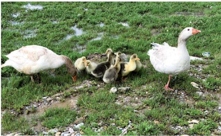
The Yazidi poultry project: the geese have offspring.