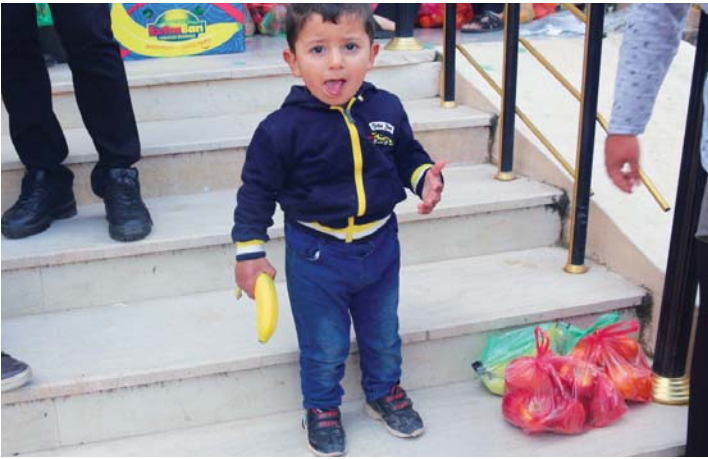
Fresh fruit for Yazidi kids till the summer. It works!

Such stories leave us speechless. Now and again people ask me whether we don't want to give up in situations where everything is getting worse. But it is precisely these shocking stories full of unimaginable