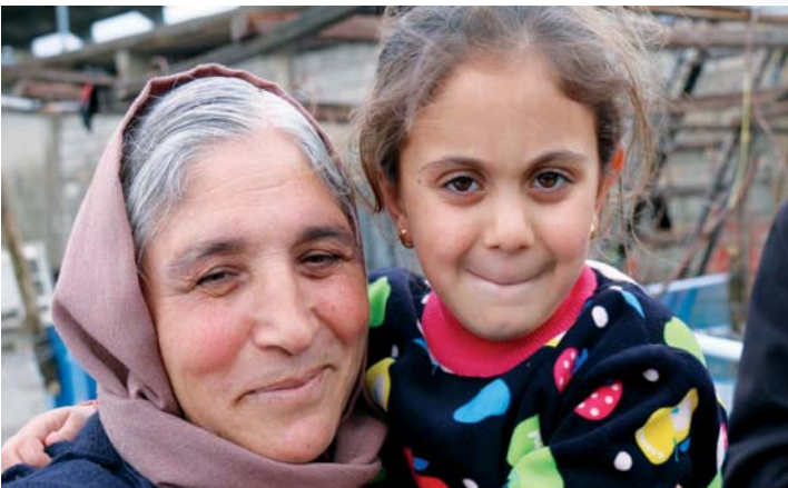
This girl survived a serious illness thanks to Shelter Now.