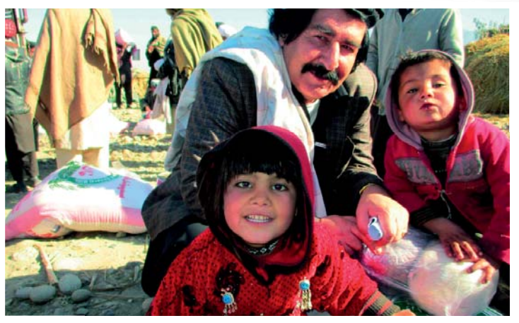
...not only the children are happy.