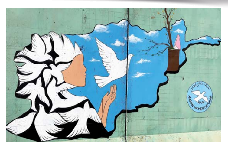
At Herat airport: Women and peace ...