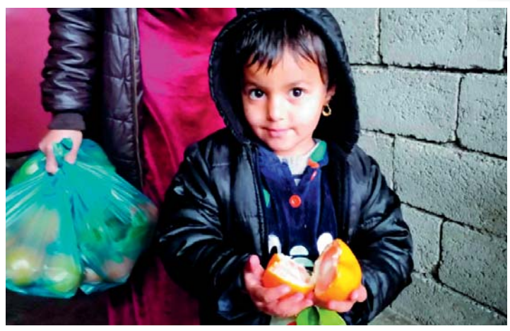
Fresh fruit for Yezidi kids till summer.