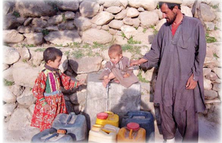
Nuristan: Fresh water in Almi village.

A drinking water project has also been completed in Nuristan. This province is to the east of Kabul and beyond Laghman. It is extremely remote and mountainous. Many villages don't even have access roads. A