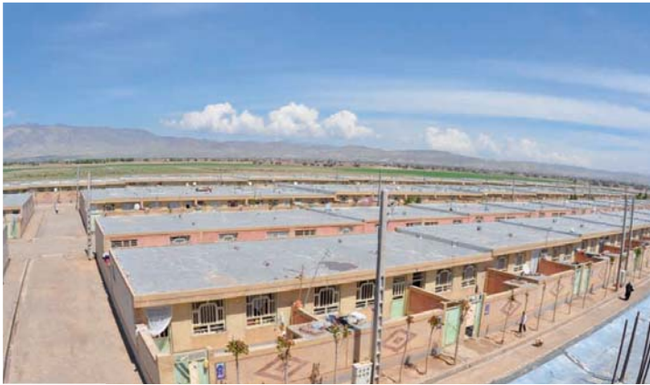
The Sharak Mustafa settlement...