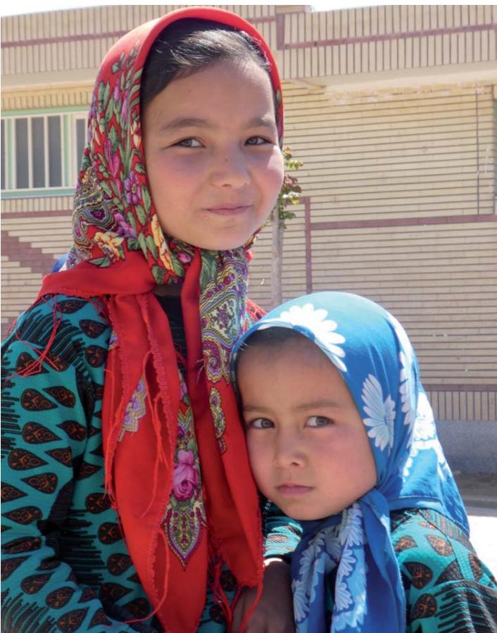
...built for widows and children. SNI will help.

In countries like Afghanistan it is the widows and orphans who already suffer immensely. Their problems multiply further whenever natural disasters and terrorism force them to flee their homes. A new project has opened up for Shelter Now in the province of Herat to help widows and their children.