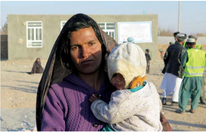
A widow and child in Sharak Mustafa