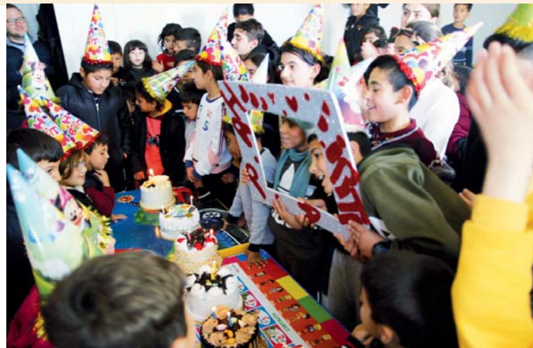
Lots of fun at the birthday party

We have found and rented a very suitable, newly built house. Now we have to get it ready to meet our needs. Further construction measures are necessary. In addition, of course, we require furniture, sports equipment, kitchen equipment, games, sewing machines, music instruments, teaching materials for artistic activities, etc. When we have completed this step we require employees with various qualifications, such as psychologists, craft workers, artists and others.