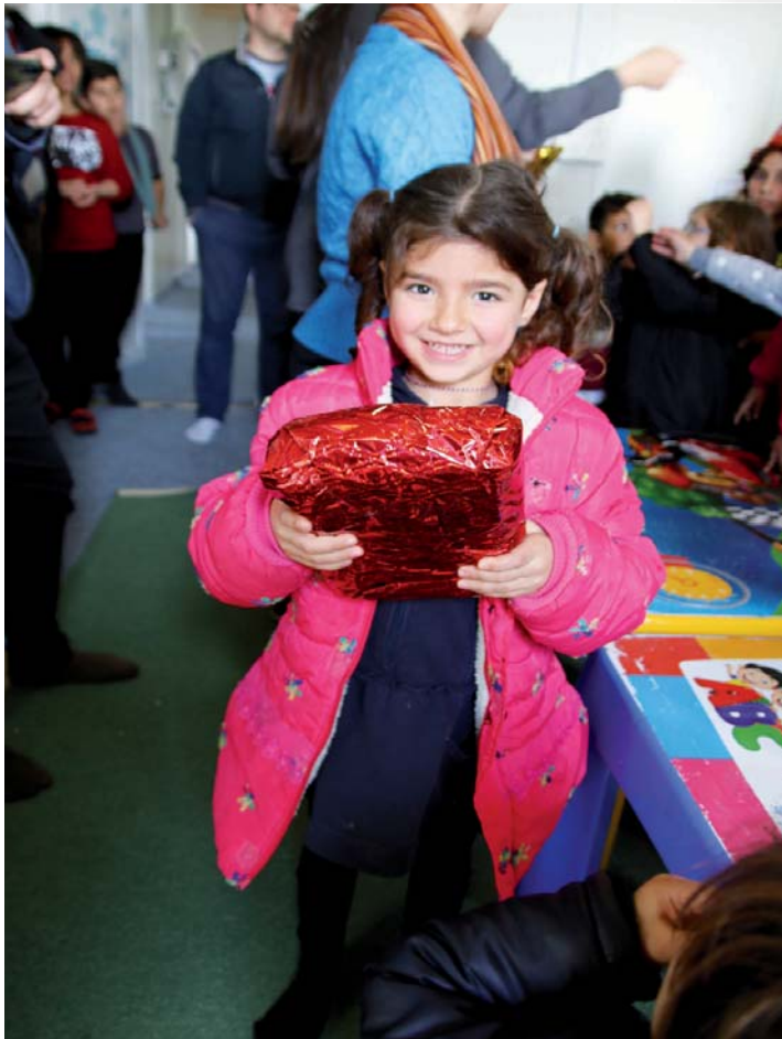
A birthday child in the Baadre Camp

In Afghanistan it is quite normal to experience temperatures of minus 10 degrees in winter and up to 45 degrees in summer. So we prepare projects before the onset of winter that will help those in need to survive the cold months: 3,600 refugees from dangerous areas of Afghanistan live in tents in the “Hewaata Waald Camp” near Kabul. We were also able to help school children in Panjshir, and Kuchies in Laghman. In addition, many refugees in Kurdistan.