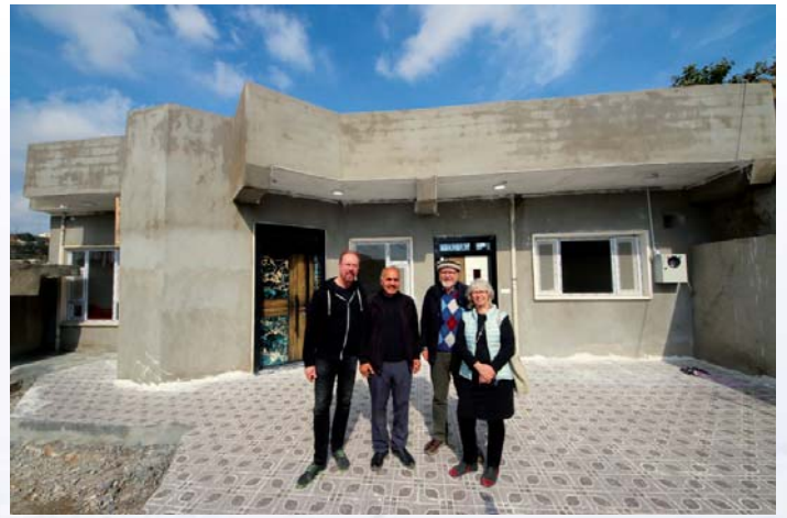
Visit to the new therapy centre in Baadre

These children had to experience terrible atrocities perpetrated by the IS terrorists. Many have lost their courage to face life. The elder brother of some school children took his own life two weeks ago after losing all hope. The children's centre is there to prevent such things happening to these children. In the meantime we have 120 girls and boys. I have been deeply touched by their contagious joy and would love to have stayed there.