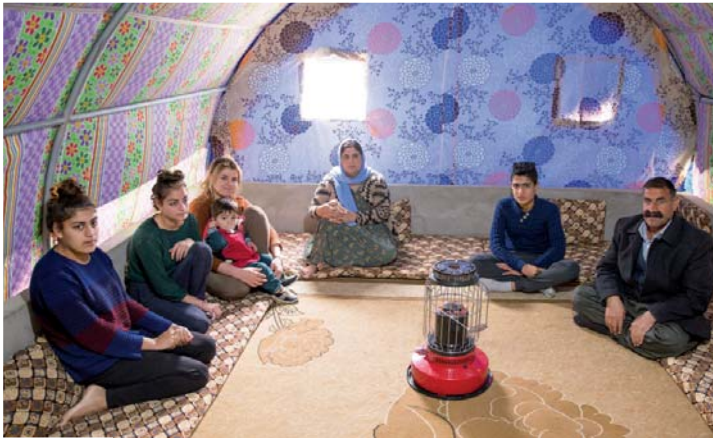
Ezidi refugees can finally heat their tents