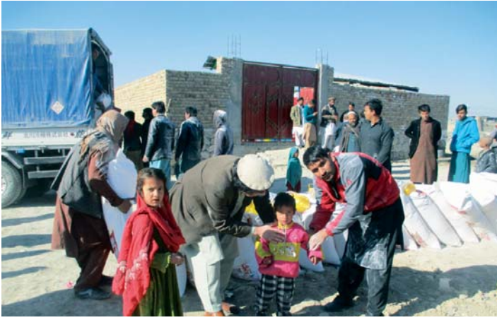
Distributing food in the Hewaat Waald Camp